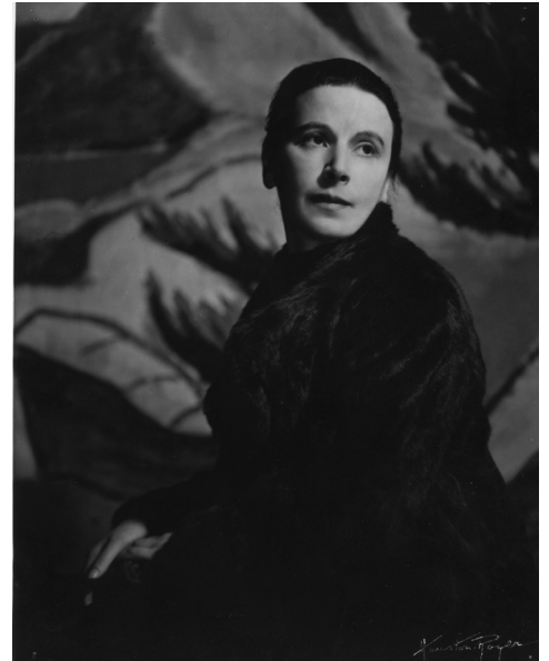
Above: Marie Rambert in 1937

Marie Rambert was born in Warsaw in 1888. Although she showed exceptional aptitude for dance at school it was not until 1904 when she first saw, and was genuinely inspired by the work of Isadora Duncan, that she seriously considered becoming a professional dancer. Her parents however, had other plans and in 1905 Marie Rambert was sent to Paris to study medicine. She was too young to begin medical studies immediately and so continued her dancing while she waited, eventually earning a modest income and reputation by giving dance recitals in fashionable Parisian salons. In 1910 she went to Jaques-Dalcroze's School of Eurhythmics in Geneva, and when Diaghilev needed someone to help Nijinsky teach his cast the complicated rhythms of Stravinsky's Rite of Spring , Dalcroze recommended Marie Rambert. She joined the Ballets Russes in 1912 to teach eurhythmics, assist Nijinsky and dance in those ballets for which she was suitable. She remained with the company for a year.