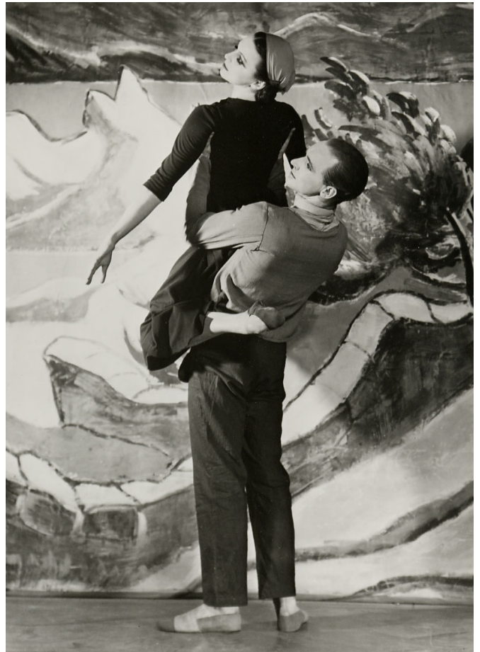
Above: Dark Elegies

Bruce also recognised the importance of developing talent from within the Company, regularly offering the dancers the opportunity to create their own short works, platformed at 'choreographic workshop' performances in London.